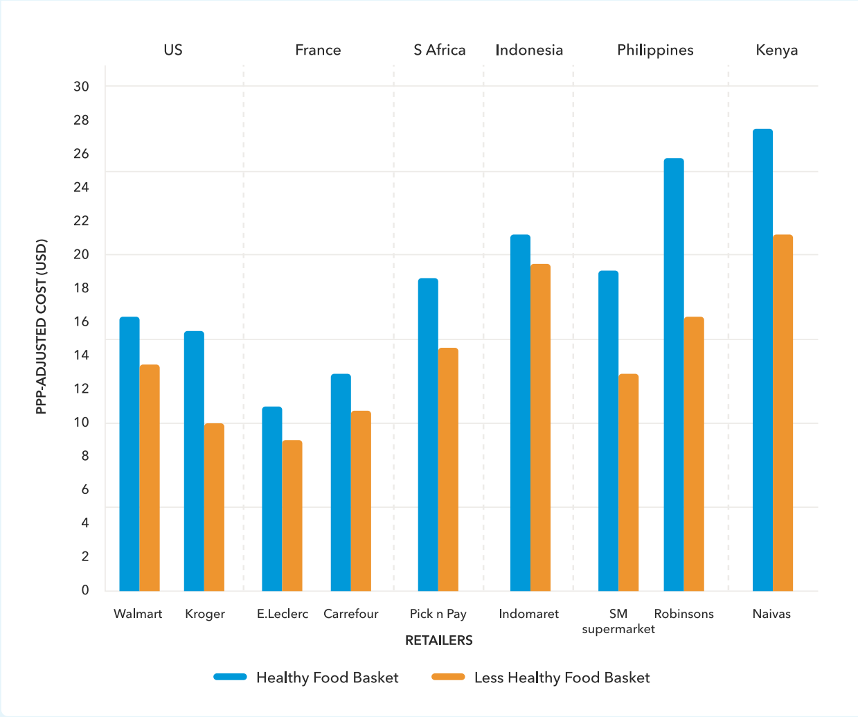
FIGURE 2 THE COST OF HEALTHIER AND LESS HEALTHY RETAIL FOOD BASKETS PER PERSON PER DAY AMONG SELECTED RETAILERS AND COUNTRIES (PPP-ADJUSTED USD, 2024)

Note: The percentage difference shown next to each histogram represents the excess cost. This is calculated by: (\text{Cost of healthier retail food basket} - \text{Cost of less healthy retail food basket}) / \text{Cost of less healthy retail food basket} \times 100 .