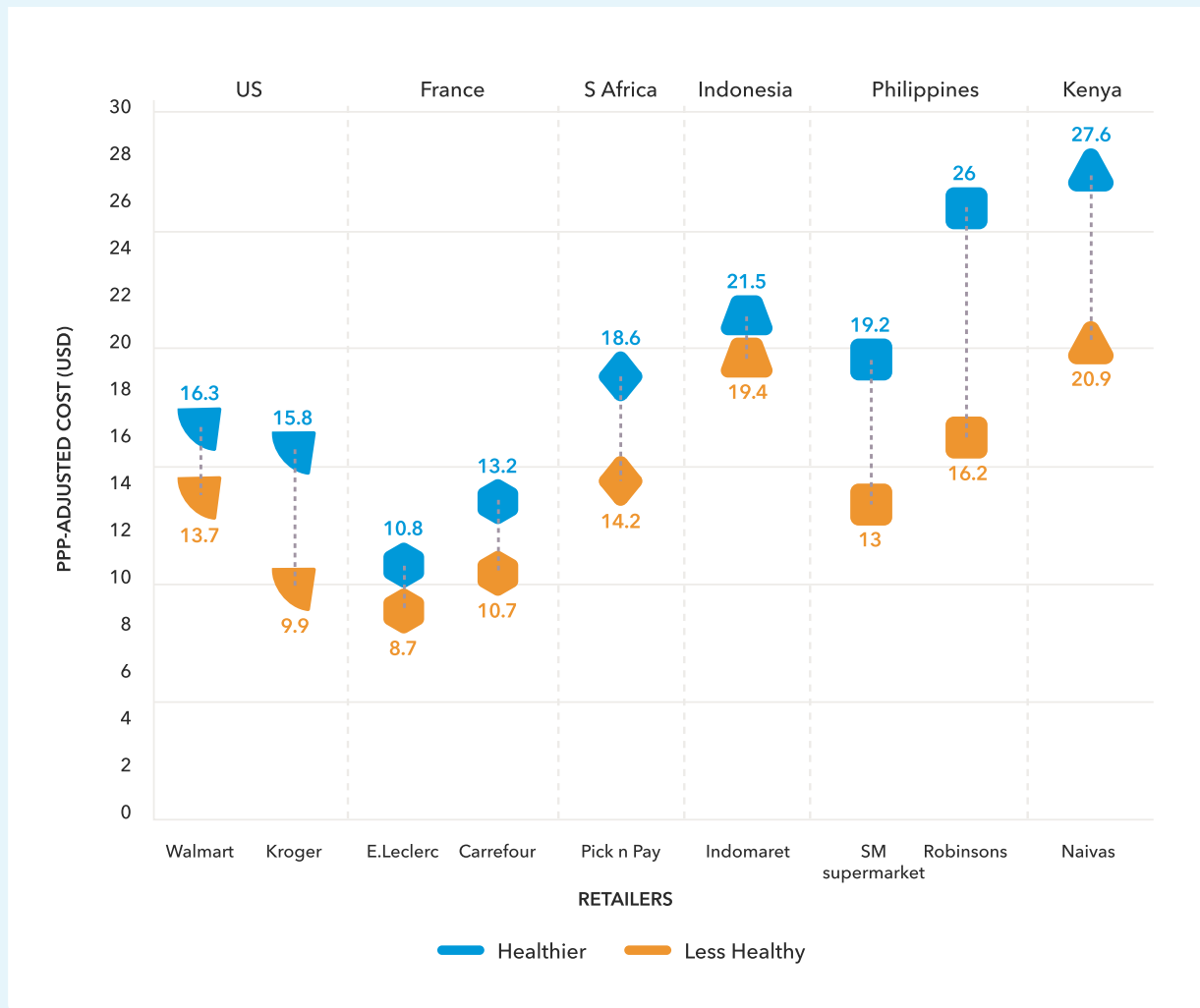
FIGURE 1 COST OF HEALTHIER AND LESS HEALTHY RETAIL FOOD BASKETS PER PERSON PER DAY AMONG SELECTED RETAILERS AND COUNTRIES (PPP-ADJUSTED USD, 2024)

The cheapest healthier and less healthy baskets were observed at E.Leclerc in France, while the most expensive baskets were found at Naivas in Kenya (Figure 1). Overall, retailers in high-income countries (France and the US) consistently offered the lowest-cost baskets, while those in LMICs (Indonesia, South Africa, the Philippines, and Kenya) had higher costs (Figure 1).